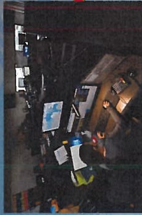
GGV PD DISPATCH