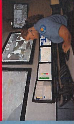
CARE AMBULANCE NOTIFIED BY CAD TO CAD AND PROCESSES REQUEST FOR AMBULANCE