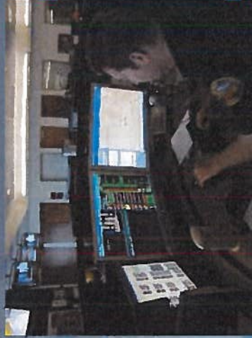
OCFA ECC DISPATCHER