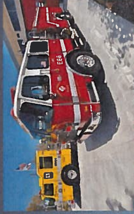
OCFA STATIONS ALERTED AND UNITS PAGED