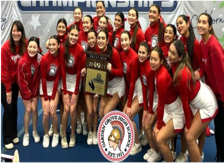
GARDEN GROVE HIGH won the CIF-SS Division 4AA traditional competitive cheer title.

On Tuesday night, it will be the cheerleaders who get cheered.