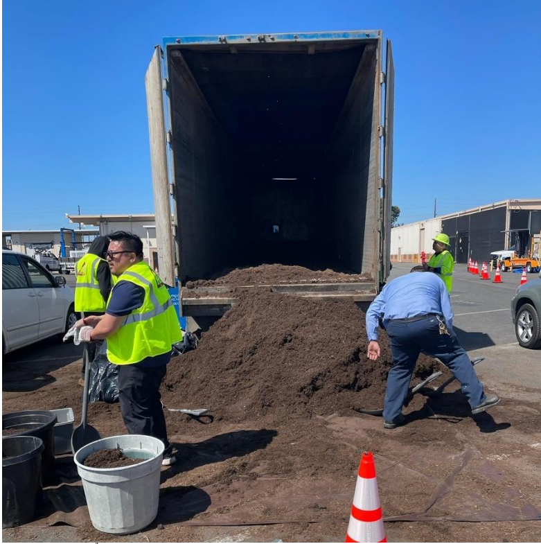
Phân bón chuẩn bị cho cư dân. (Hình minh họa: City of Garden Grove)

Muốn biết thêm chi tiết, xin vào trang web ggcity.org/organics .